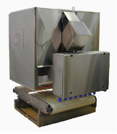
Figure 3 - A baked goods inspection station for tortillas, by Montrose Technologies Inc. The red laser line is used for measuring 3D shape and the bright white line is used for measuring color. The blue nozzles protruding from the box below the laser camera box are "air knives" that blow defective product down and out of the gap between this station's conveyer belt and the next conveyer belt. See www.montrose-tech.com

As an example, consider the inspection of baked goods such as hamburger buns, English muffins or tortillas. These baked products are sent by conveyer belt through an inspection station. At the inspection station a laser profiler measures the product's three-dimensional structure and a bright light and a color camera are used to measure product color (see Figure 3). The product moves quickly, so the bright light is needed to give the color camera enough reflected photons to form an image. This video shows some of the process of making English muffins: www.sugden.ltd.uk/products/EMPLANT.asp